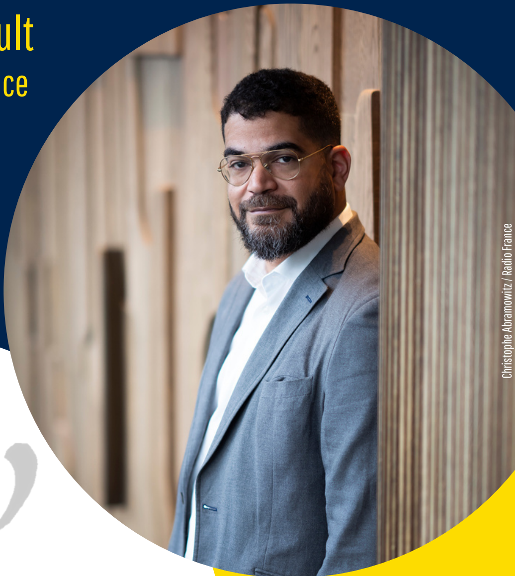
Christophe Abramowitz / Radio France